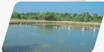
Fish pond drainage and irrigation